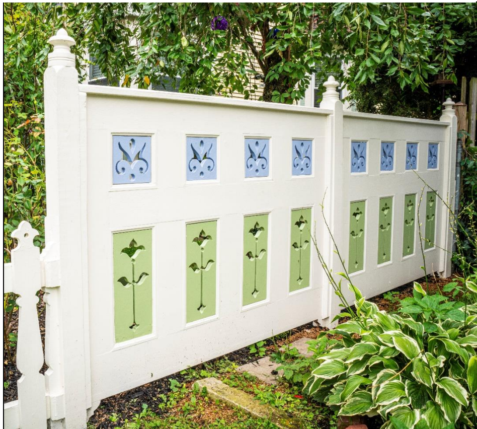
Reproduction of Queen Anne Style Fence