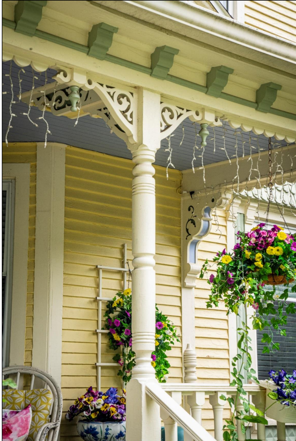
Restoration of Front Porch Award, Grand Rapids Historic Commission, March 2022