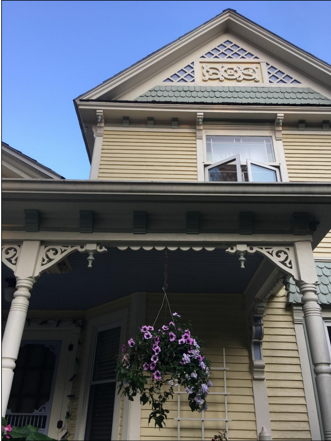
Office of BARNS INTO BIRDHOUSES Queen Anne Residence, 144 Fitzhugh SE, Grand Rapids MI Award, Outstanding Residential Preservation Project Grand Rapids Historic Commission, March 2022