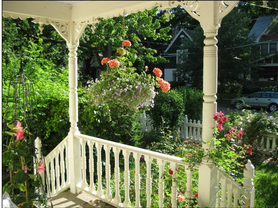
Restoration of Front Porch, Street View